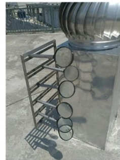
Figure 4. The lenses

Lenses used as heat collector from the sun light. Our first design used single lens with 400 mm in diameter in each side, but because of difficulties in its production, we changed it to multi lenses like we mentioned above.