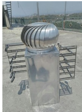
Figure 1. Solar Reflector Cyclone Wind Turbine Generator

Our device used 12 lenses (6 lenses in each side) with 90 to 100 mm in diameter, to heating up the air column. We adjust the lenses angle every 15 minutes to set their focus according to the movement of the sun.