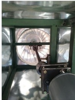
Figure 5. The shaft and gear box

We used gearbox to increase the rpm of the initial axis. The ratio is 1 : 2.