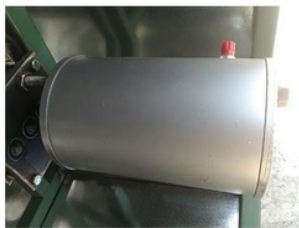
Figure 6. DC generator