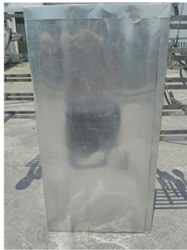
Figure 2. Air column

The air column is box made of Zn plate, with 1 mm thickness, 400 mm x 400 mm cross area and 1200 mm in height.