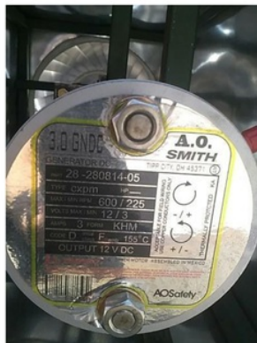
Figure 7. DC generator specification.