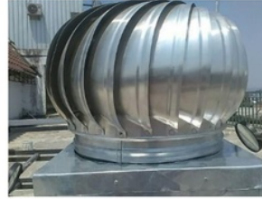
Figure 3. Cyclone turbine

It's a wind turbine, which works through the principle of air pressure difference. When the air inside the cyclone turbine is hotter than the air outside, the hotter air will move up and leave the turbine, it leaves the pressure drop in the air column under the cyclone turbine. The pressure drop will make the air outside to enter the air column, and the air circulation will turn the cyclone turbine.